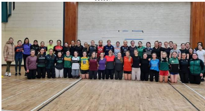
Pictured below: The Senior ladies and camogie teams together to start pre-season