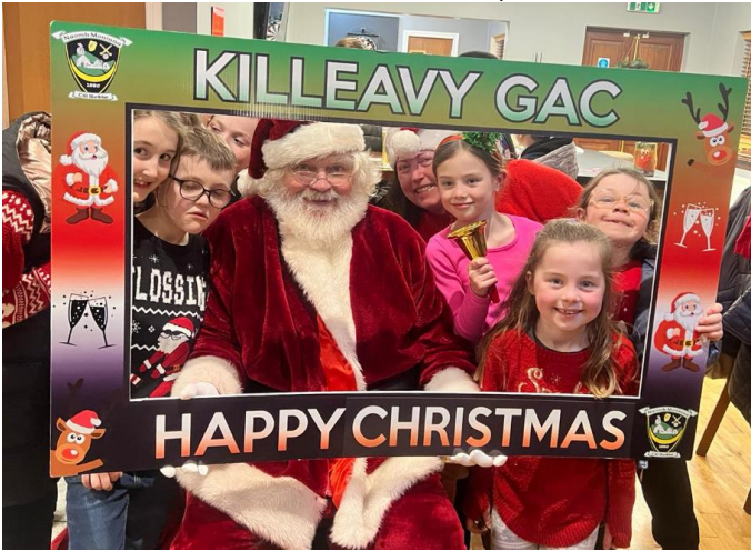
Below: Santa Claus visits Killeavy GAA

At the same time as Killeavy's elves were totting up the financial gains of the Christmas Draw, Santa's elves were running around the social club busying themselves for his arrival. He didn't disappoint. From 4pm to 9pm, Santa moved seamlessly between groups, ensuring to hear the wishes of all the children in the parish.